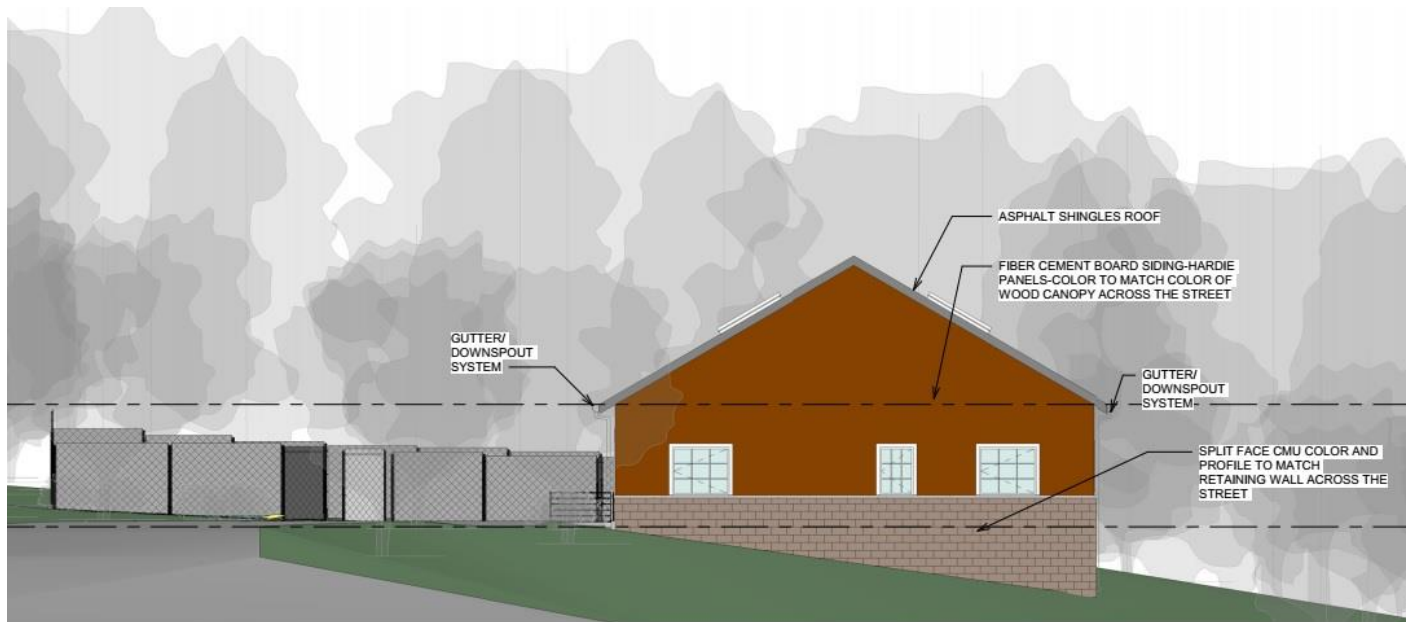
Artist's conception of new maintenance facility from Potomac Hills Street with fenced facility yard and retaining wall.

addition, design elements of the new maintenance facility will be incorporated to match those of the Outdoor Classroom and Picnic Shelter which was completed in April 2019 and which is located just across Potomac Hills Street from the site of the new maintenance facility.