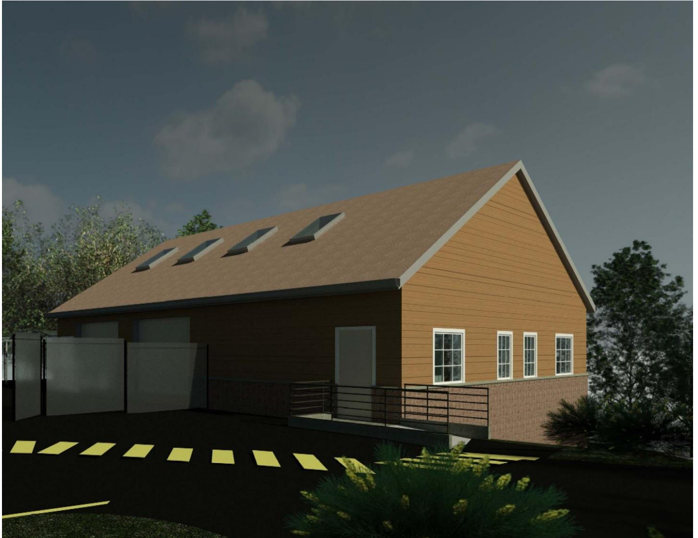
Artist's concept of maintenance building showing public restroom entrance.

In accordance with the Riverbend Park Master Plan, this maintenance facility will provide storage space for equipment, vehicles and a rescue boat; a work area for maintenance, carpentry and display creations; and a public restroom.