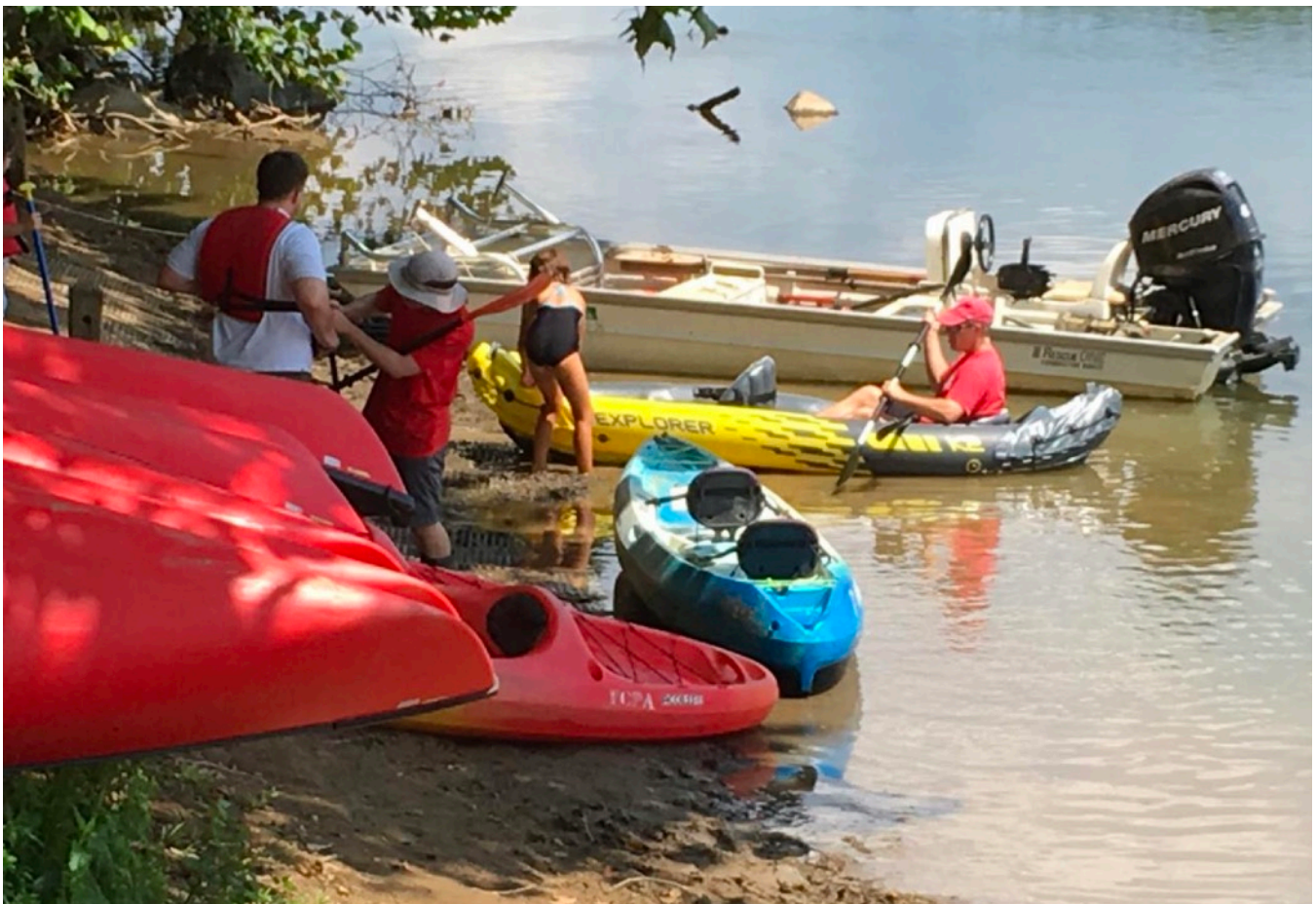
Many different boats line up at the Riverbed Park launching area for a day of enjoyment on the river

sunscreen, extra clothing, sunglasses, water, snacks, a cell phone in a dry case, and a dry bag are recommended. Boaters should be well hydrated and continue to drink water during their trip. Using the correct paddling technique is also important to prevent loss of control of the boat and possible injury. The Riverbend Park staff will demonstrate proper paddling techniques for beginners. More information on proper paddling techniques is also available on www.americancanoe.org . The Riverbend Park staff also offers basic kayaking classes to learn paddling techniques and safety information to make your trip on the river a fun, safe and enjoyable one.