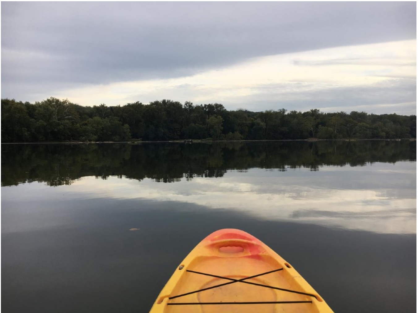
A summer early evening view of the park from a kayak on the river

The Potomac River at Riverbend Park is truly a magnificent asset for the park and its visitors. It is a reasonably stable and reasonably predictable body of fresh water which sustains and supports all manner of wildlife, and provides great enjoyment and relaxation for boaters. The river, however, must be respected, both from a safety point-of-view and as a natural resource which sustains many different forms of life. The Friends of Riverbend Park and the Riverbend Park staff work to accomplish all of these goals - enjoyment of the river, protection of the river as a natural resource, and the safety of all those who venture out on the water. In these times of climate change and extreme weather, we are indeed fortunate to have the Potomac River here at Riverbend Park to sustain us and enjoy.