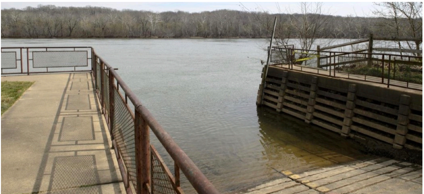
The boat launch for private boats at the Visitor Center

Water Safety Specifics – Safety on the water is paramount. All boaters must wear properly-fitted life jackets; boating is at your own risk; and swimming in the river is prohibited. Pets are not allowed on boat rentals, and the number of persons allowed on boats varies by the type of boat (one person per single-seat kayak, two persons per two-seat kayak, three persons per canoe, and one person per paddleboard). Water skiing, jet skis, big boats and tubes are not permitted. The river is shallow and rocky at Riverbend Park and only minimum draft craft such as kayaks, canoes and paddleboards are suitable for navigation there. Boaters are advised to go upriver (North) from the boat launching area and always to stay upriver of the line of buoys marking the Washington aqueduct dam about a 1/2 mile downstream from the Visitor Center. No boating is permitted downriver of this line of buoys.