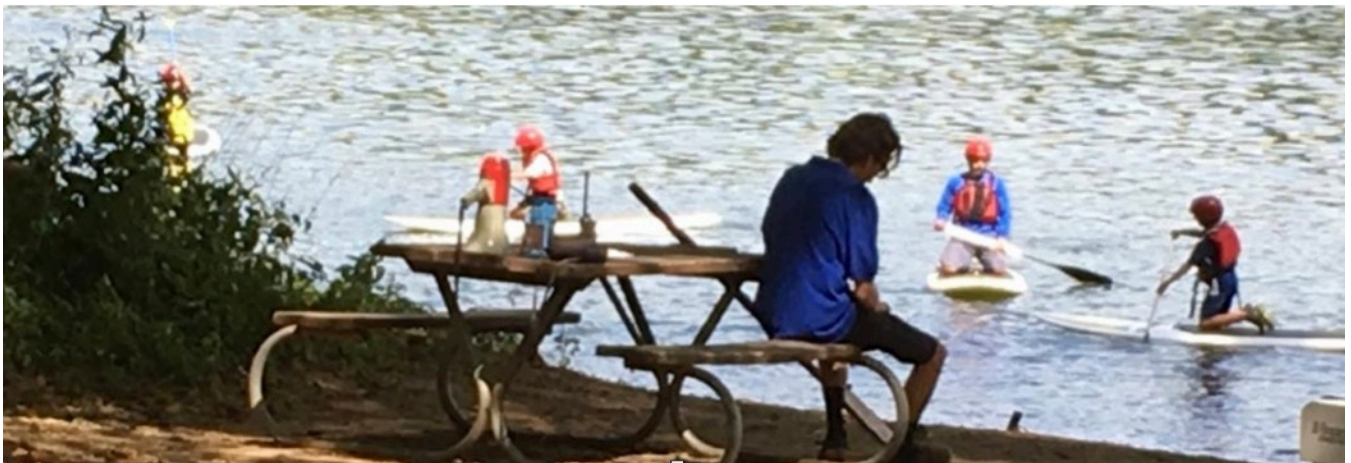
A group of paddle boarders set off from the boat launch area at Riverbend Park

Over the years, FORB has also contributed to numerous river-related programs and projects such as support of water-quality measuring equipment and river clean-ups. The Potomac River and its vitality are of great importance to FORB, both for all the enjoyment it brings to park visitors and the preservation of the park's natural resources.